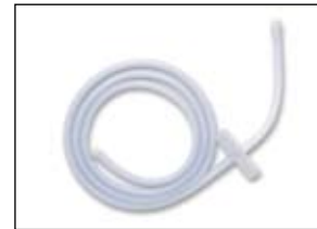
CO 2 EFFICIENT Tubing Set (Cat. No. 6601)