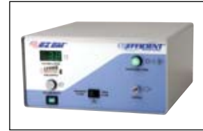
CO 2 EFFICIENT Endoscopic Insufflator (Cat. No. 6600)