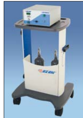
System Rolling Cart (Cat. No. 6405)