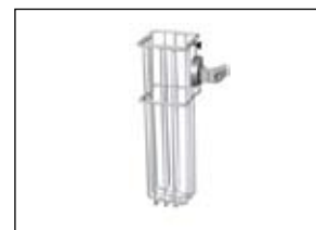
“E” Sized Cylinder Tank Cage (Cat. No. 6603)